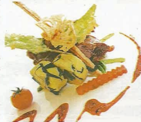
Baked coffee-crusted beef tenderloin with 'cha soba', chef selected vegetables and sweet Thai chili sauce.

For reservations or enquiries, call 07-521 2121.