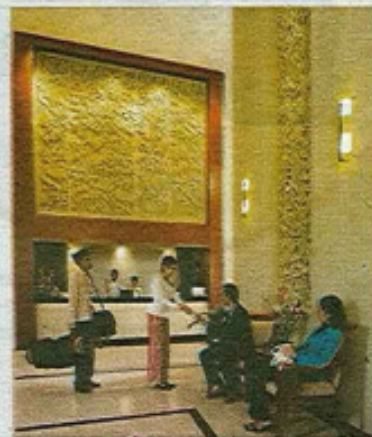
Expect friendly and helpful service

Golf courses, swimming pool, gift shop, spa and gym.