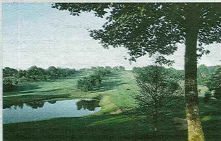
Breathtaking scenery of the Pulai golf course

None. It's a secluded stand-alone resort.