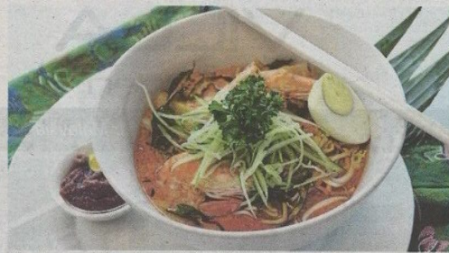
The Nyonya laksa is among the dishes offered in the promotion.

Dried spices, fermented soybeans and soy sauce add complexity and richness to this recipe. The ikan cili garam Klebang, priced at RM 30++ per serving, is a Nyonya-style fried fish with home-made spicy chili paste. The spicy paste is made using