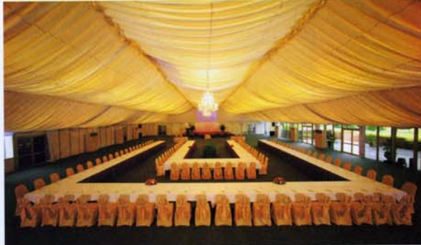
Different meeting formats on offer at Pulai Springs