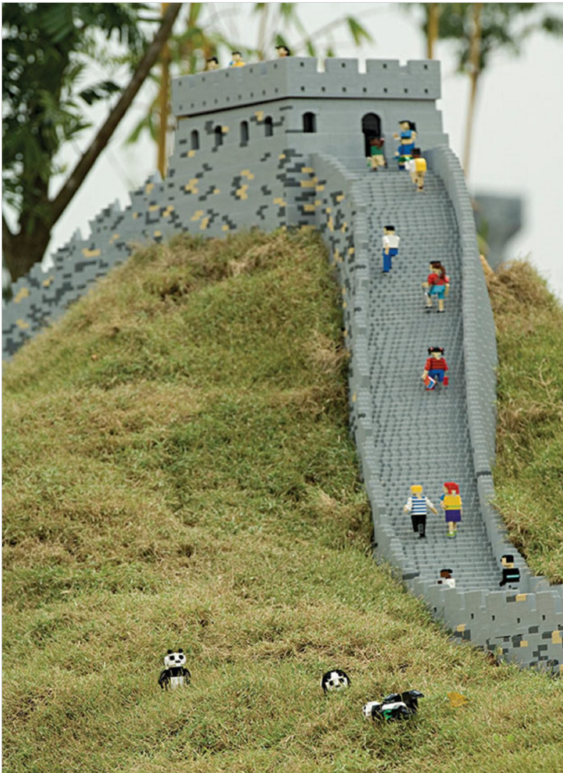
Scale the Great Wall at Johor Bahru's Legoland.